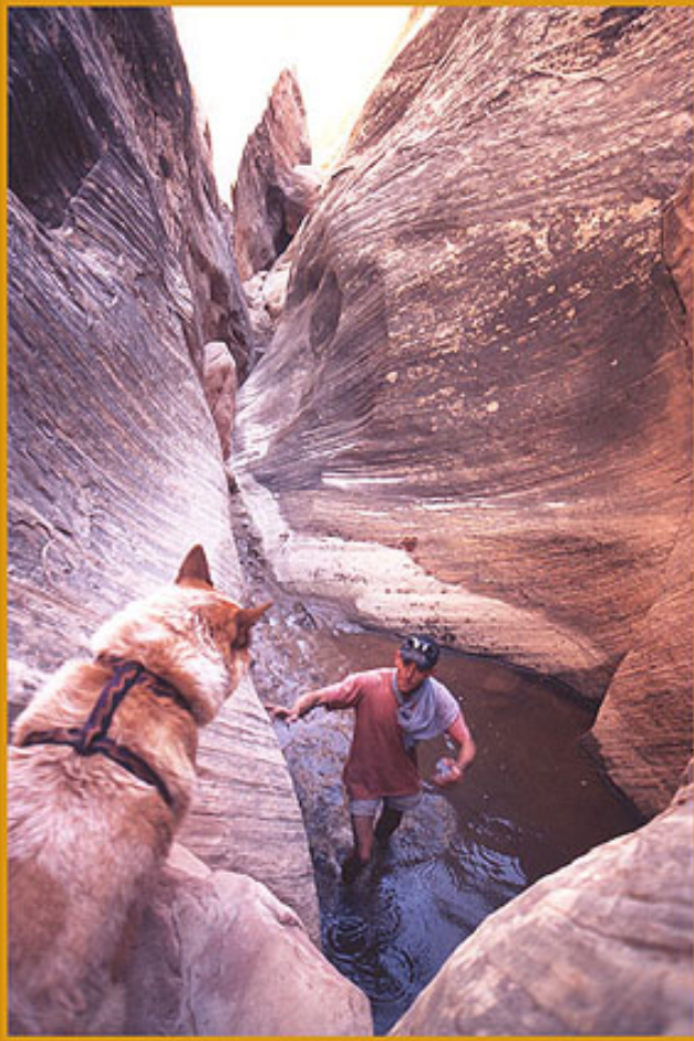
Chopper & Mike in Dang Canyon

The reverse direction is good fun - ascending Dang is more challenging than descending, with many 5.8ish boulder problems to surmount the many chockstones.