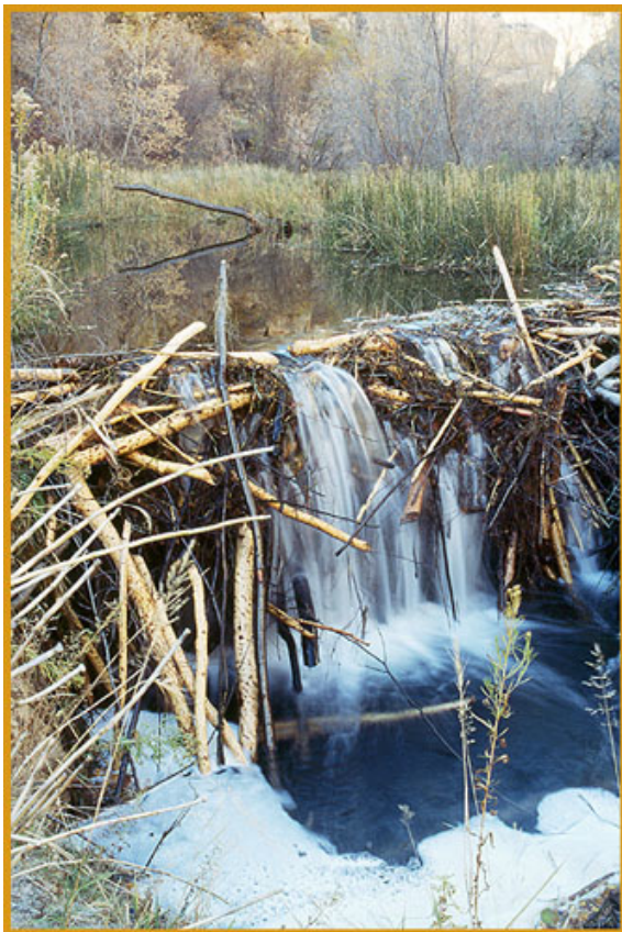
Lower Calf Creek

Lower Calf Creek is a classic family hike on a flat, graded path up a lush red rock canyon to a beautiful 110 foot waterfall. Zowie! Can you ask for anything more?