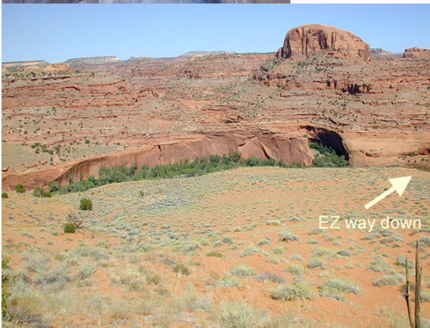
Photo: The Fence Canyon slot makes a delightful diversion from the arduous backpack along the Escalante.

downcanyon, Fence turns into a wide slot (with shade - this is good) as it pierces a bluff and opens to a slickrock valley. There is a hidden arch on the left, and the slickrock area ends in a big drop to the bottom of Fence. Traverse the right edge of the slickrock (exposed, 4th class, but doable with big packs) and gain the bench beyond. Turn right, and climb sandhills until the rounded dome can be seen. Beeline to the river, and descend via a wide, moderately-steep sandy slope.